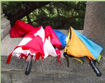
Preparing for rainy days?

A Grants Committee has been formed to explore other grant opportunities particularly related to historic preservation. We hope to report good results by early next year and will then kick off a campaign to gather matching funds. Anyone interested in participating in the Grants Committee should contact Vaunie Graelty.