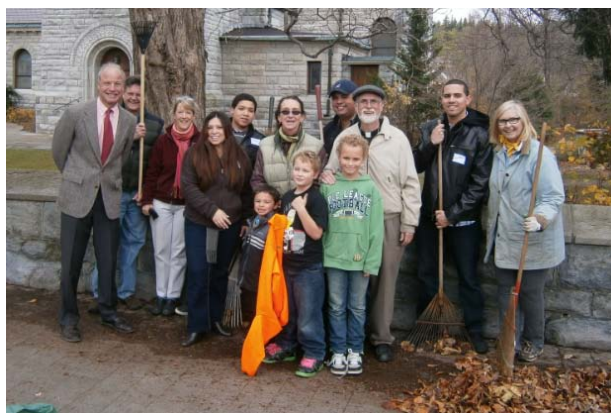
Leaf raking is one aspect of stewardship ...