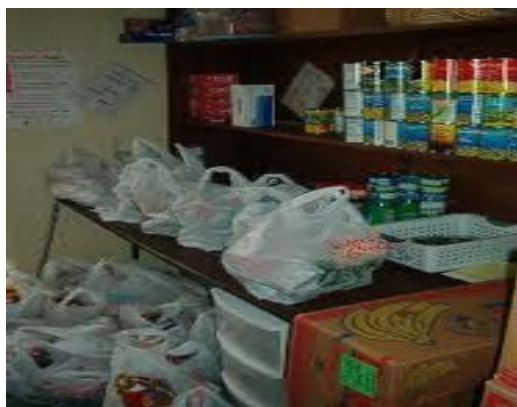
So is the food pantry!